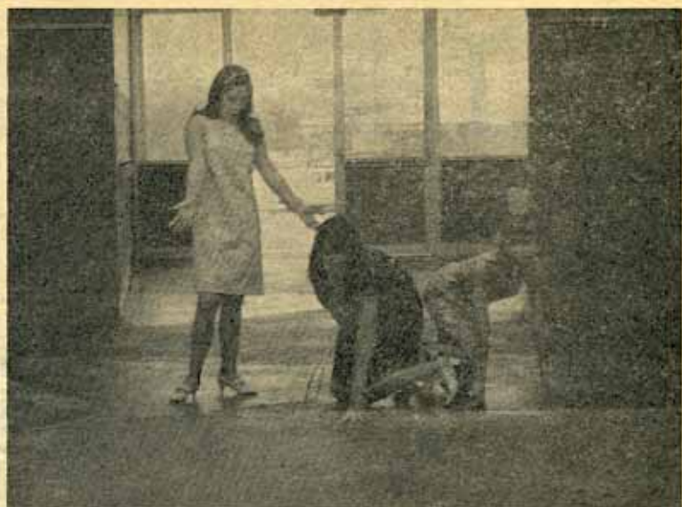
... Where did they go? ...