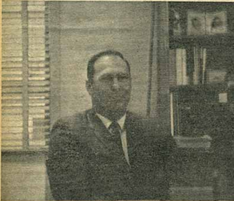
... very honored to be here ...